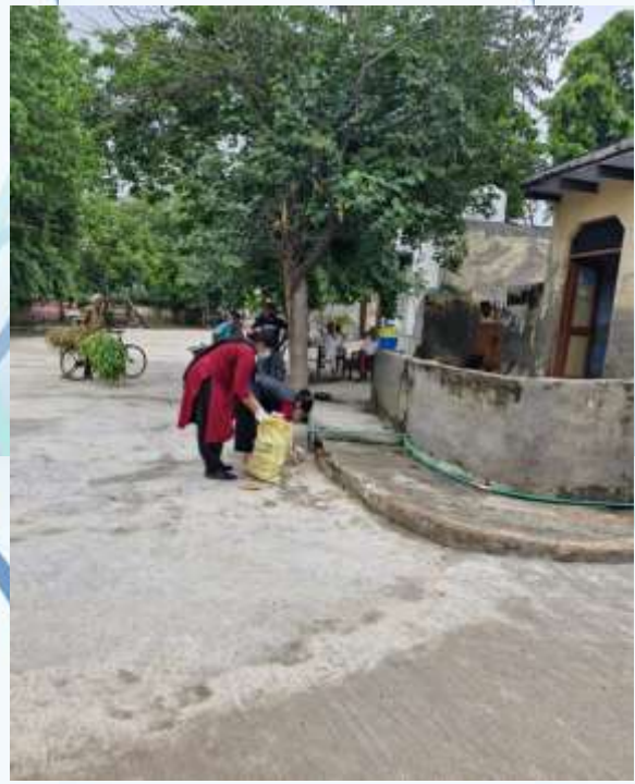
Shramdaan by officers & other staff, RTRMH