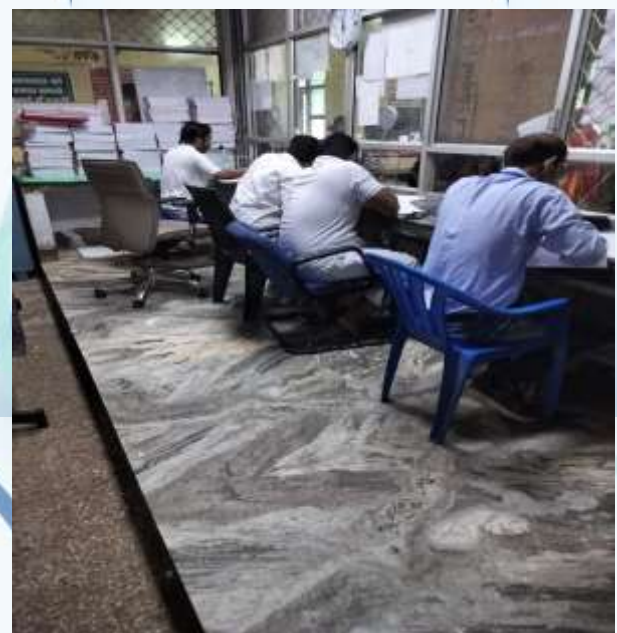
OPD Registration Counter