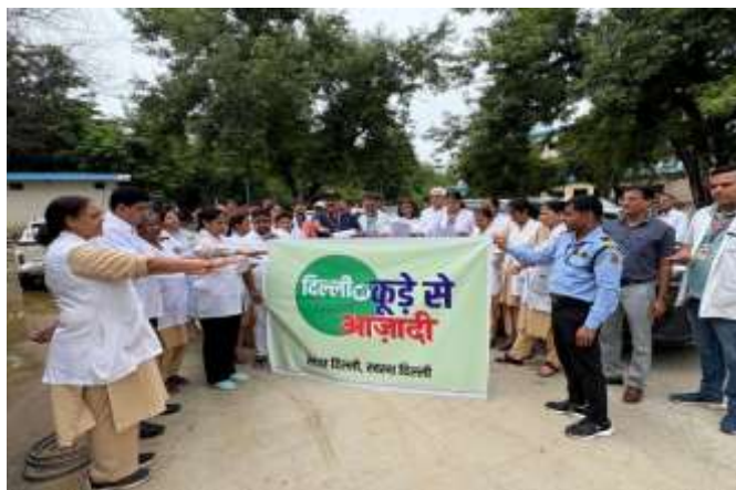
Pledge taking on 01.08.2025