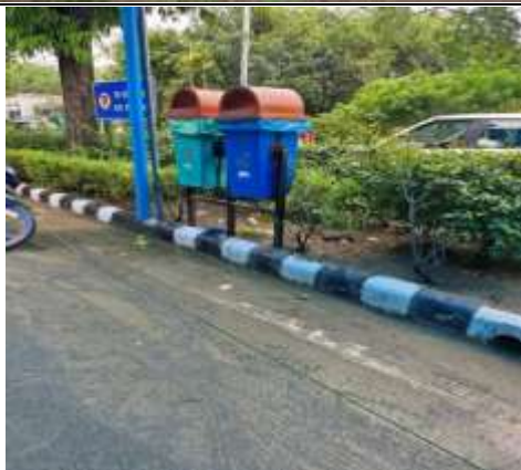
Outer area of OPD