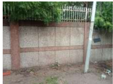
Outer Wall of the Hospital