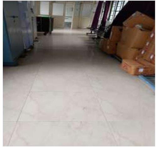
Main OT area